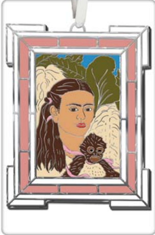
Fulang-Chang and I Ornament